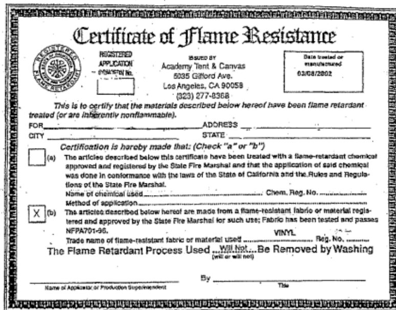
FLAME SPREAD CERTIFICATE (ITEM 2)