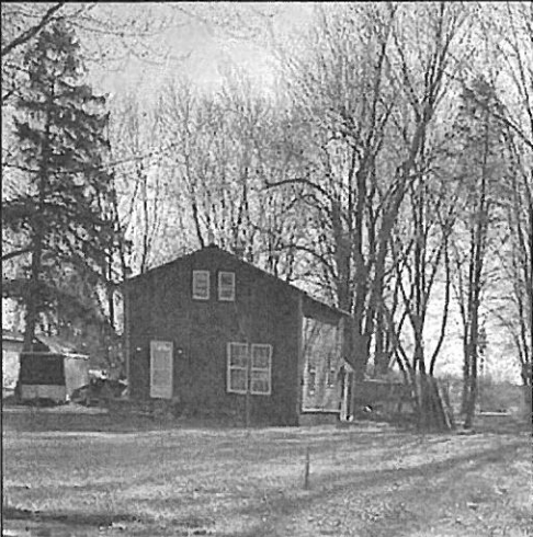
2022-04-07 Remove all debris.jpg