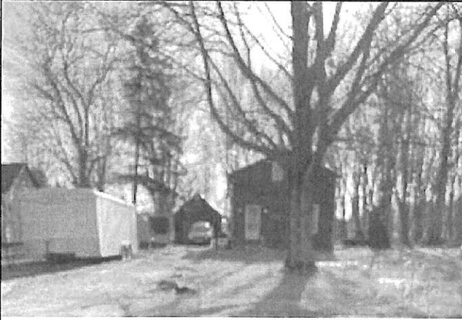
2022-04-07 Remove trailer from driveway .jpg