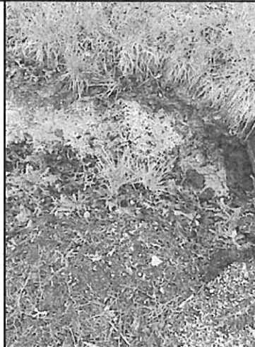
2022-07-22 culvert .jpg