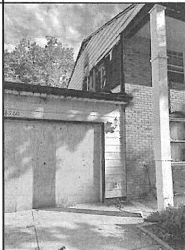
2022-06-06 House fire .jpg