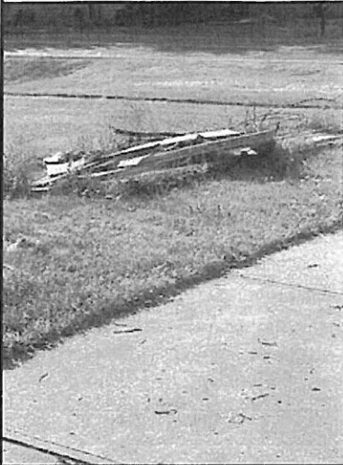
2022-06-06 debris from house fire .jpg