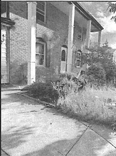
2022-06-06 unsafe structure .jpg