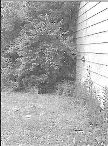
2022-06-06 overgrowth back yard .jpg