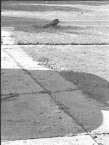
2022-06-06 Mailbox laying on the ground .jpg