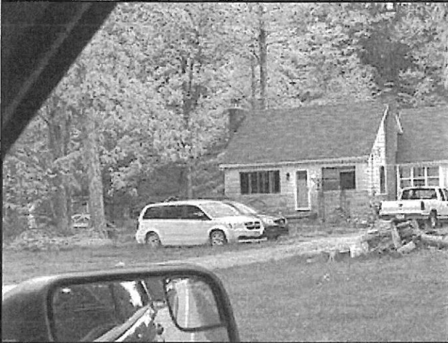
2022-05-20 27146 Schady Rd.jpg