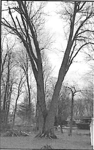
2022-04-19 tree greenbriar.jpg