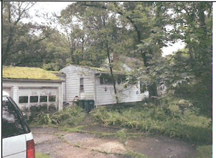
2022-03-09 Pictures of unsafe structure 08/20/2021 .jpg