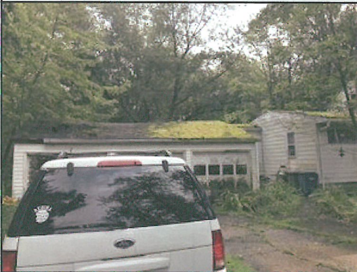
2022-03-09 Pictures of unsafe structure 08/20/2021 .jpg