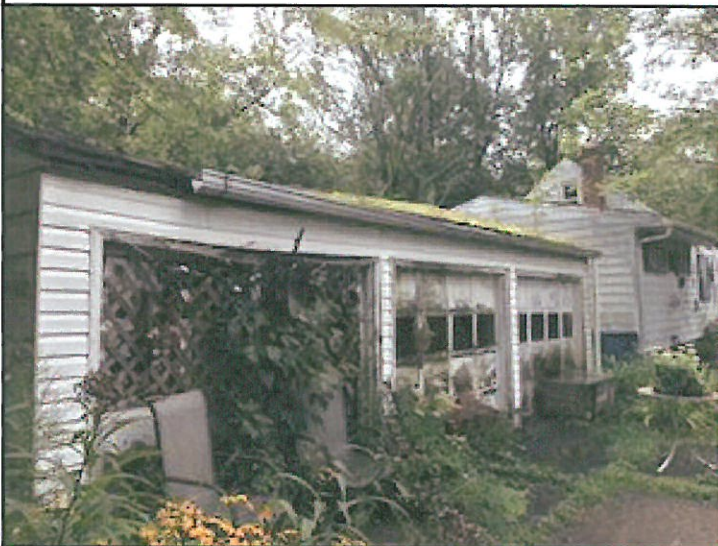
2022-03-09 unsafe structure .jpg