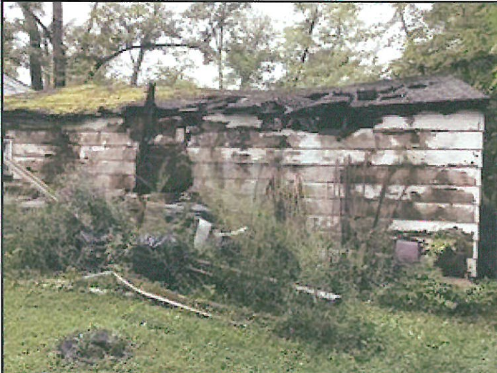
2022-03-09 Pictures of unsafe structure 08/20/2021 .jpg