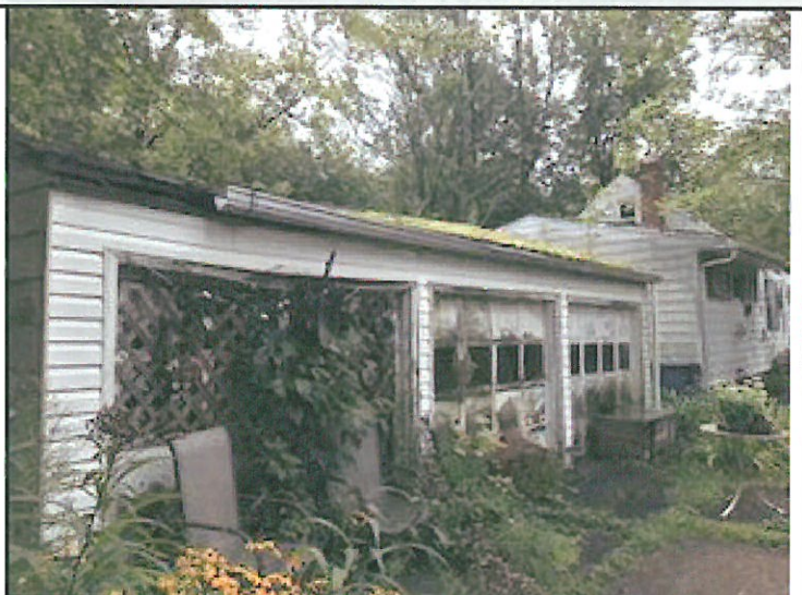
2022-03-09 Pictures of unsafe structure 08/20/2021 .jpg