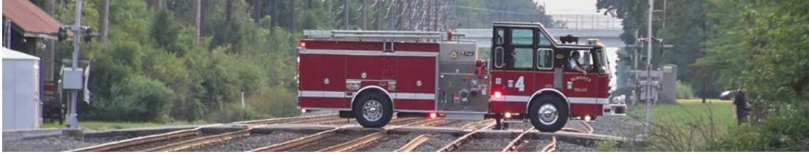
An Olmsted Falls fire engine crosses the railroad tracks on Brookside Drive during the Olmsted Heritage Days parade in 2014.