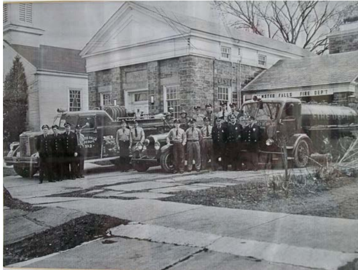
This photo of the fire department members with their equipment is reportedly from 1942, but it seems instead to be from the early 1950s because it includes the General fire engine purchased in 1947 and the 1,500-gallon tank truck purchased in 1950 and sold in 1955.

“Its 200 gallon booster tank was ample for most area of the Village, but because of the lack of city water on Lewis, Usher and Cranage Roads, as well as in Westview, a used 1500 gallon tank truck was purchased in 1950,” Fenderbosch wrote in an essay in Offenberger’s book. “Unfortunately, this latter truck proved to be of questionable mechanical dependability, and in 1955 it was sold to make way to a new triple combination Howe-equipped International Harvester truck, complete with two-way radio, 800 gallon tank, hose, booster lines, extinguishers and ladders. Pumping capacity of the new truck was the same as that of the 1947 General, 650 s.p.m.”