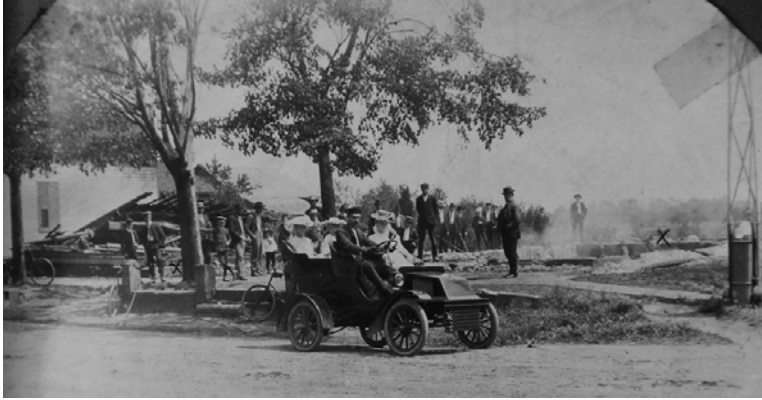
Another notable fire just north of the railroad tracks along Columbia Road destroyed the first Odd Fellows Hall. This photo from August 8, 1903, shows people who came by in an early automobile to see what was left.