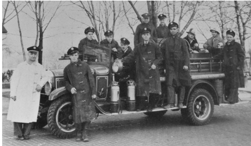
This 1939 photo shows the firefighters with the 1928 Whippet firetruck that served the department for about two decades.

“Complete modern fire protection was introduced in the Village in 1928 with the addition of a new Whippet fire truck. Equipped with a 350-s.p.m. gear driven rotary pump, this truck also contained a 100 gallon booster tank with 200 feet of ¾ inch booster hose on two reels, 35-foot extension ladders and 400 feet of 2½ inch hose.”