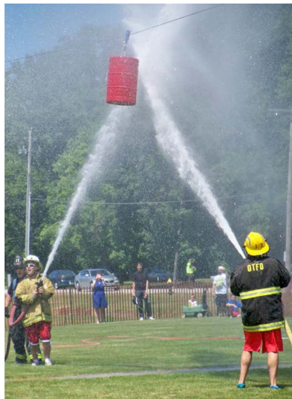
These firefighters were among those who competed in water battles during Olmsted's bicentennial celebration in 2014. The team on the right represented Olmsted Township.