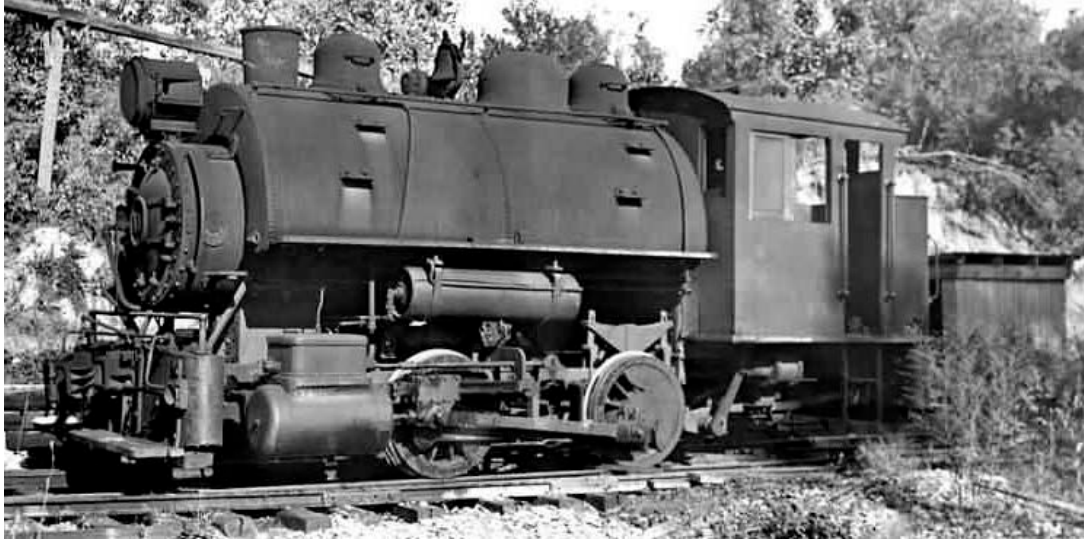
This is what the locomotive looked like in 1953, when South Bend Sand & Gravel Company owned it.