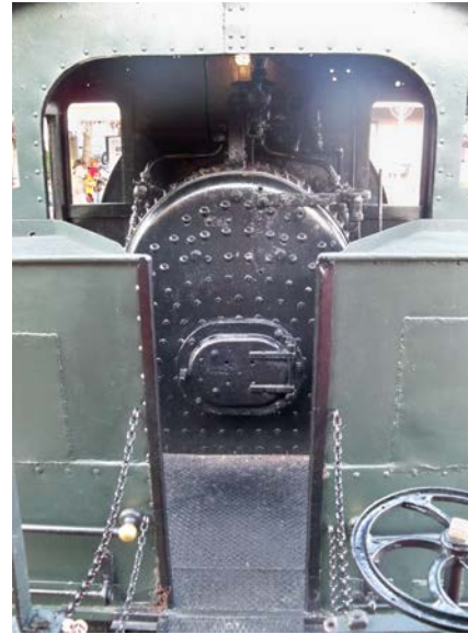
Visitors can climb up to peek inside the locomotive.