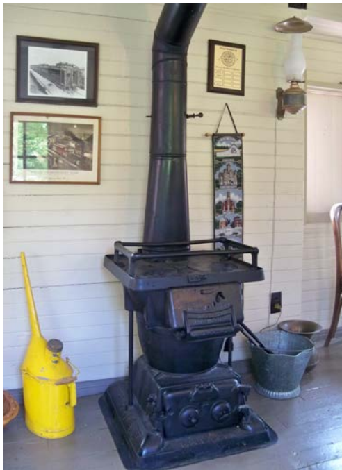
The caboose has its original stove.

“I looked at it for a week or 10 days, and I said, ‘It doesn’t fit. It doesn’t look right.’”