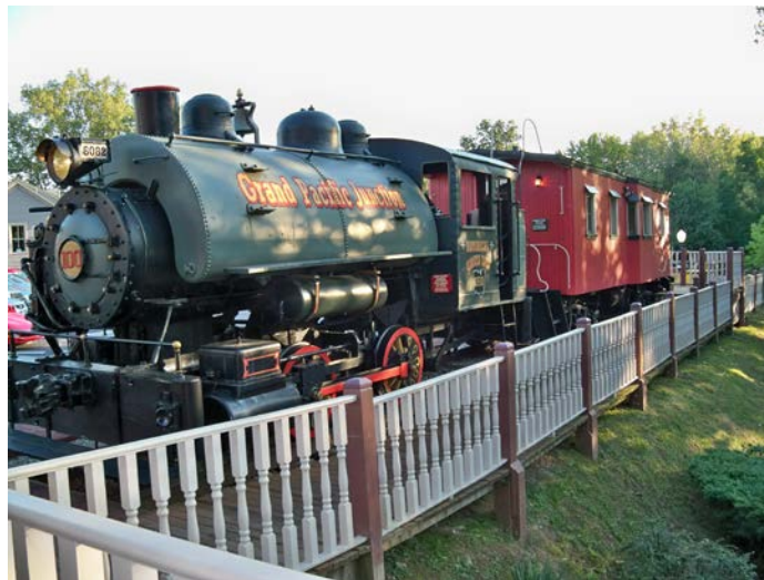
The Vulcan locomotive is much more colorful at Grand Pacific Junction than it was in South Bend, Indiana.