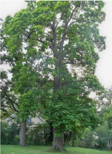
This northern catalpa tree is believed to be one of the largest of its species in Ohio.