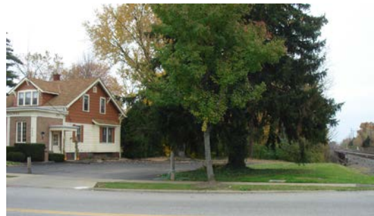
The first and second Odd Fellows halls originally stood here next to train tracks.

The building was constructed in 1905 on the other side of Columbia Road – the east side – and on the other side of the railroad tracks. In other words, it was located about where the parking lot for Falls Veterinary Clinic at 8017 Columbia Road now stands. It served not only as a meeting place for the