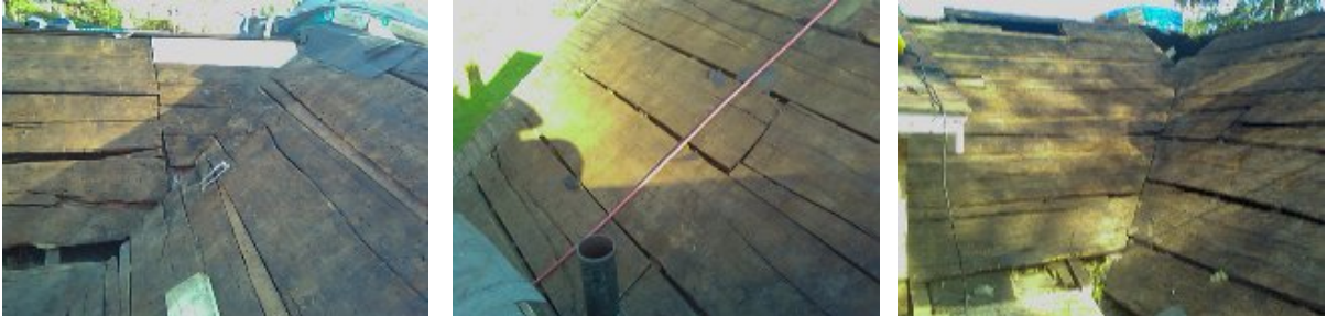
These photos show the wide plank boards that were revealed when the roof was removed in the fall of 2008.