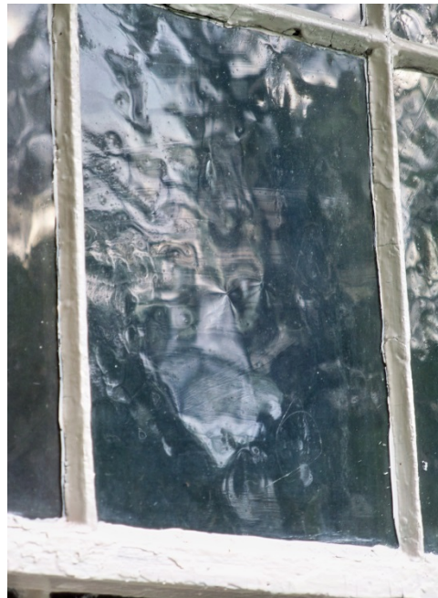
Some of window panes have been in the house since the 1800s. The surface is not as smooth as modern glass.

Reminders of the past are not just visual. “Sometimes, it smells like horses in the summer on