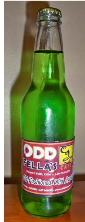
This bottle of pop was sold at Odd Fella's