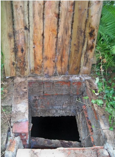
This bigger cistern gathers runoff rainwater.

Nearby is another, bigger cistern that actually goes under the side wall of the house. Roberts estimates it is 10 to 11 feet deep. “It’s fed by the gutters,” he said. “The downspout will feed it, and it has the usual brick wall between them, which acts as a kind of filter. So when the clean water gets to the brick, it rolls over the top. It’s a pretty rudimentary way of doing things.”