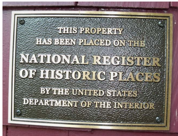
The house is on the National Register of Historic Places.