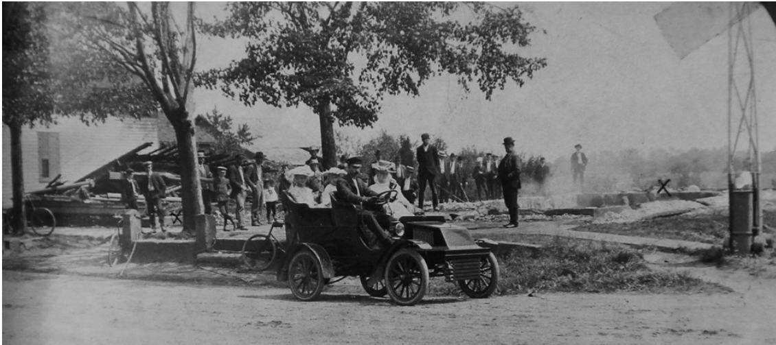
This photo, dated August 8, 1903, shows the site where the first Odd Fellows hall burned down. It also shows one of the early automobiles in Olmsted Falls.

It was the second building for the Odd Fellows at that location. The first one burned down in 1903. It reportedly caught sparks from a passing train. Apparently, the Odd Fellows did not learn a lesson from that experience because they built its replacement in the same location right next to the tracks. The upper floor was their lodge hall, and the ground floor contained the Burns and Fenderbosch farm implement store as well as a bank branch. However, a few years later in 1909, the railroad wanted to widen its bridge to add more tracks. The building then was moved down the street to its current location.