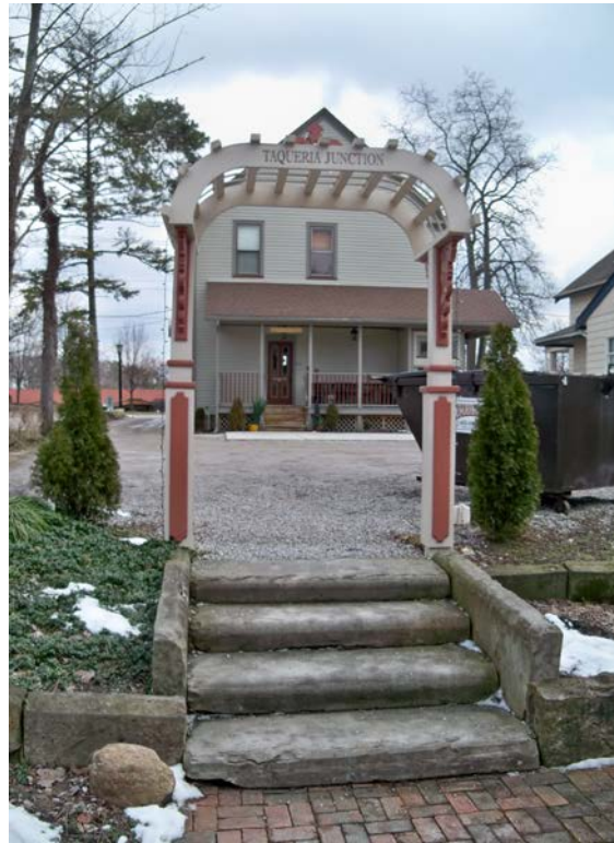
Taqueria Junction is the latest occupant of the building, seen from the front on the left and from the rear on the right, that was built by the Odd Fellows and then became home to the Grange.

Another Grand Pacific Junction building that stands in a different location than where it was built is the former meeting hall for the Independent Order of Odd Fellows. Many current and former Olmsted residents recall that it also served for many years as the Grange Hall. The building, which is at 8154 Columbia Road, now houses Taqueria Junction, the Mexican restaurant.