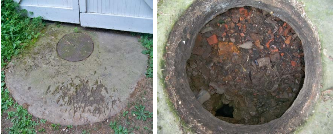
This cistern next to the garage contains bottles and other objects dating back at least to the 1920s and probably earlier. The left photo shows it with its cover on, the right photo with it off.

a hot day. The smell is still in the wood,” Roberts said. “It is amazing. It’s been a long time. We find horseshoes around here. We find lots of old nails, square handmade nails, hand-cut nails. We’ve dug around the yard a lot of places and found a lot of shards of pottery and bottles. And there’s an old cistern right here around the side of the garage.... They used it as a trash dump, so there are bottles in there. We started digging. We found some bottles down to, I think, the 1920s.”