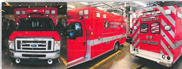
Our new 2022 Ford E-450 Braun ambulance was delivered at the end of January.

responders in providing immediate care. A File of Life decal is also placed on the door to alert first responders. This item is not just for seniors; it can be a life-saver for persons with severe allergies or chronic illness. File of Life kits are available at the Police, Fire, and Building Departments.