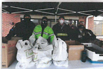
Our Officers participated in the Township's meal giveaways at the holidays.

The Department is a member of SEB (Southwest Enforcement Bureau), a multi-municipality consortium that provides personnel and assistance in dangerous situations within member communities. Officers are specially trained and are part of this SWAT (Special Weapons & Tactics) team. Pooling resources provides technical expertise and manpower to handle any critical incidents. Currently two Township Officers serve on the SEB Team.