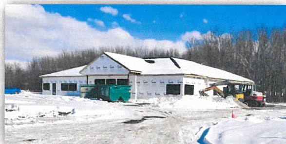
The new Southwest Hospital Medical Arts Building on Bagley Road near Town Square

Economic commercial development in our Town Center and JEDD remain a priority. We note The Renaissance expansion that includes wellness and recreation facilities and additional housing, the Southwest Hospital Medical Arts Building, and plans by Friendship Kitchen for a car wash; the last two projects are in our Town Center.