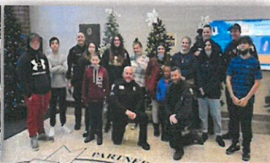
For the 14th year in a row, OTPD participated in Shop with a Cop in December.