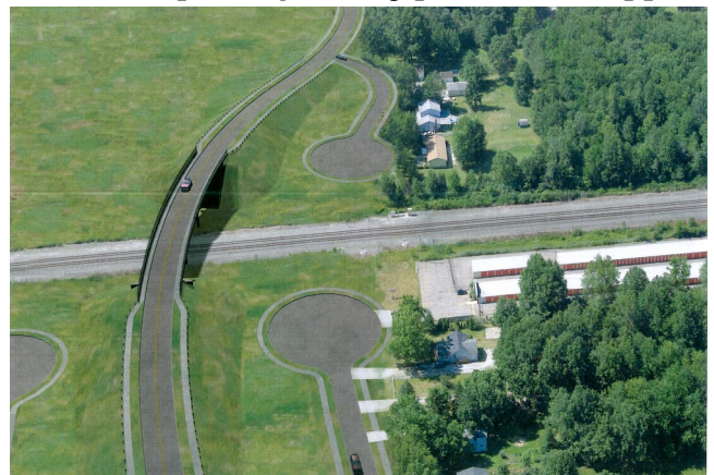
Stearns Road Overpass, looking south. Rendering provided by Cuyahoga County Department of Public Works.

For additional and updated information from this department, visit: www.olmstedtownship.org/service.cfm