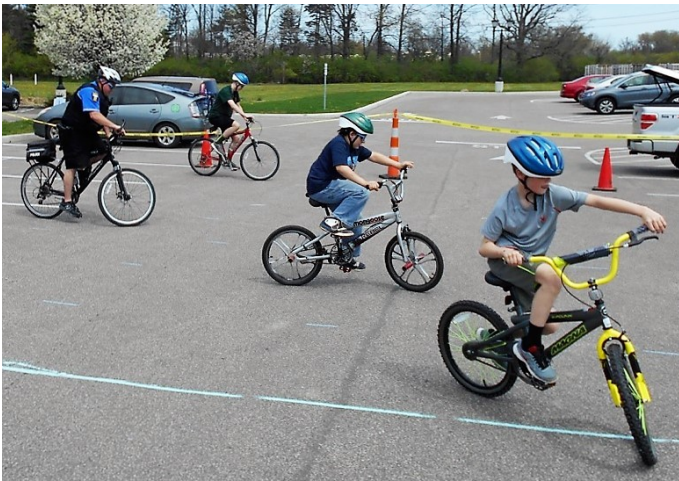
The Annual Olmsted Bike Rodeo is sponsored by Olmsted Recreation and Olmsted Community Center with support from the Olmsted Township Police and Fire Departments, Olmsted Falls Police and Fire Departments, and the Olmsted CERT.

The mission for every member of the Township Police Department is to affirmatively promote, within available resources and engaging in lawful police functions, a feeling of security and safety for every member of our community.