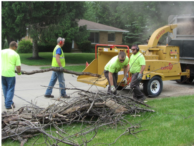
The last day for branch chipping this year will be Oct. 26. Branch chipping takes place the last Monday of the month, from April through October.

The Township will provide Curbside Leaf Collection for the 2015 fall season. Leaves will be picked up from tree lawns with an industrial leaf vacuum, with a minimum of three passes through the Township. Bagged leaves, branches, brush, garden waste, grass clippings and trash will not be picked up as part of this program. Updates on the progress of the collection will be posted on the Township website ( www.ohmstedtownship.org ). Collection will begin in mid-October and run through early December. You may also dispose of yard waste including leaves until Nov. 27 on the regularly scheduled trash pick-up day. Holiday trees will be collected the first and second full weeks in January on regular collection dates.